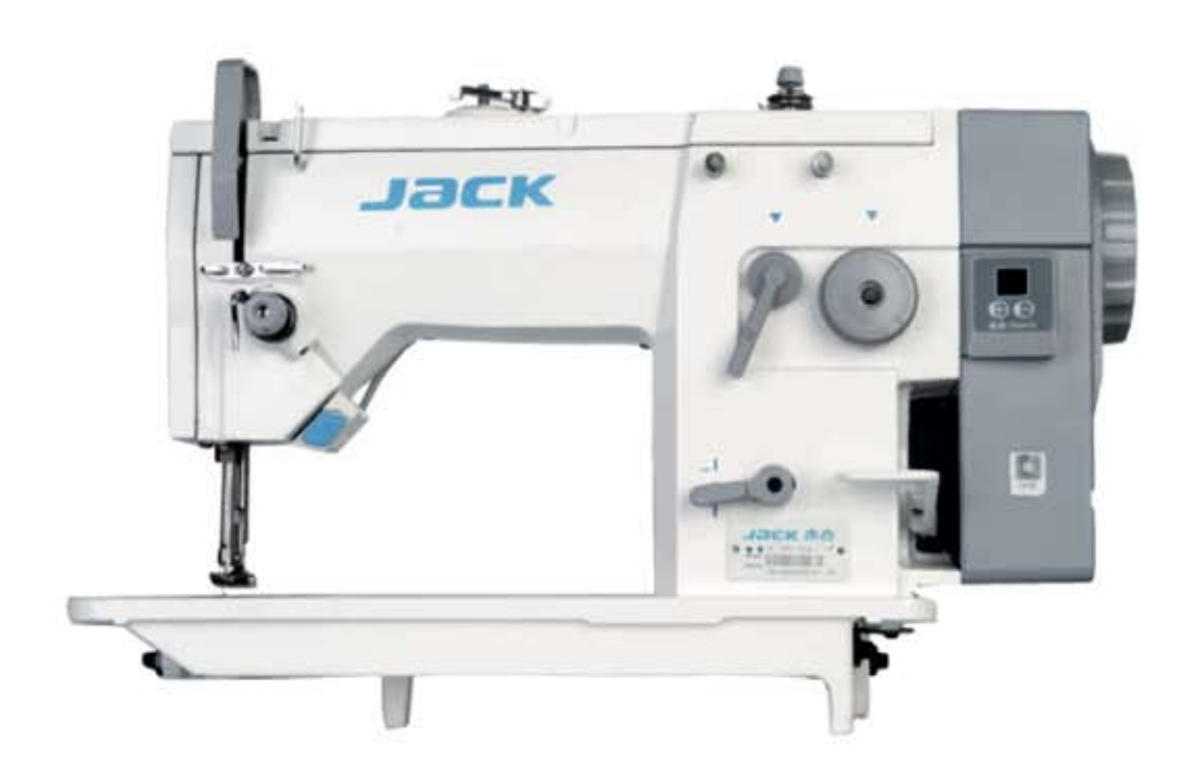
The JK-20U machine is suitable for sewing: women's underwear, jackets, gloves, elastic reinforcements and other products that require zigzag stitching.